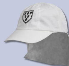
*Legionnaire hat (Nursery and Reception)