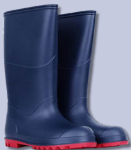
Wellington boots, any colour permitted (Please note these are kept at school during term time)