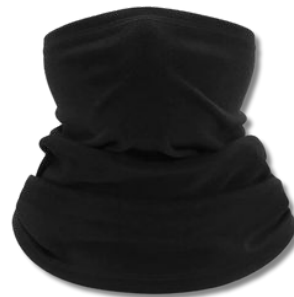
Plain black or navy necker