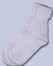
Turn over socks (must be white)