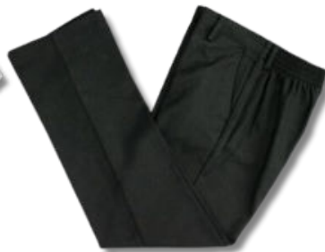
Charcoal straight leg trousers