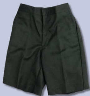
Bermuda charcoal shorts