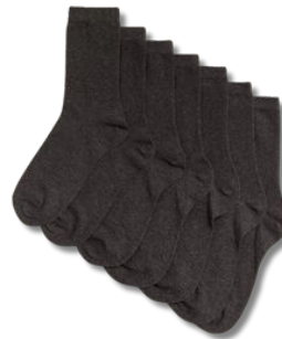
Charcoal ankle socks