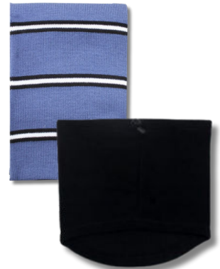
Knitted scarf or plain black snood