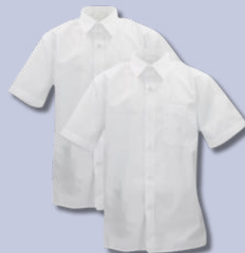
Short sleeved shirt