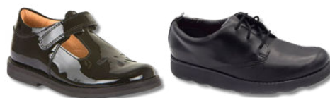
Plain black school shoes, closed toe