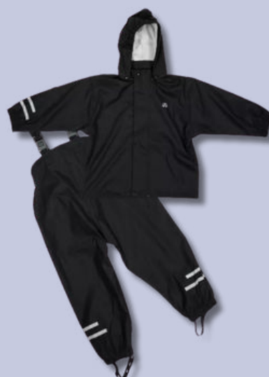
Black, PU Elka rain set, must be purchased from muddyfaces.co.uk