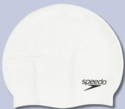
Plain white swimming cap (boys and girls)