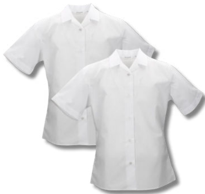
Short or long sleeved white blouse french collar