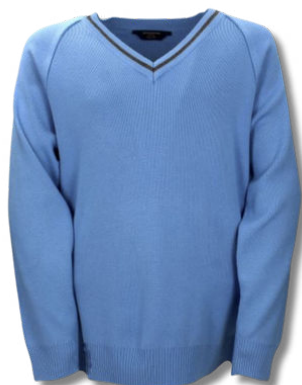
*V neck jumper