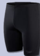
Plain black boys jammers or Crosfields branded jammers