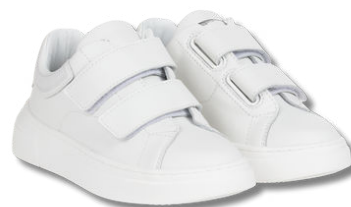
Predominantly white velcro trainers with non-marking sole