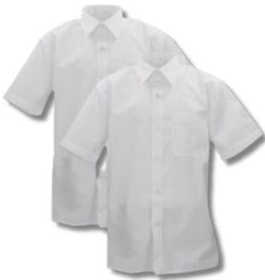
Short or long sleeved shirt