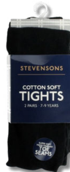
Black knee high socks or plain black tights