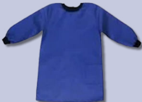
*Blue nylon painting apron