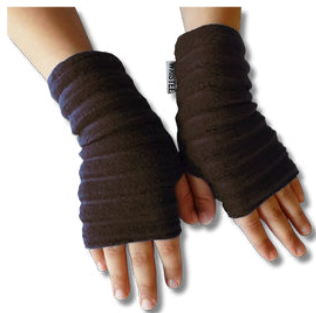
Plain black or navy wristees