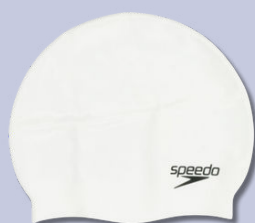
Plain white swimming cap (boys and girls)