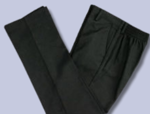
Charcoal straight leg trousers