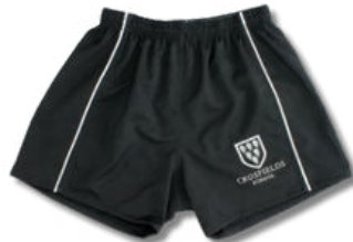
*Games shorts (boys)