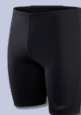
Plain black boys jammers or Crosfields branded jammers