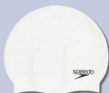
Plain white swim cap (boys and girls)