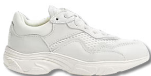
Trainers with non-marking sole