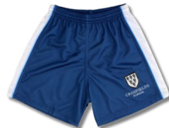
*PE shorts (girls and boys)