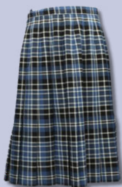
*Skirt (worn second half of Autumn term and all Spring term)