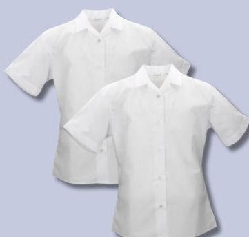
Short sleeved white blouse french collar