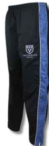
*PE track pants