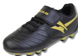
Velcro football boots