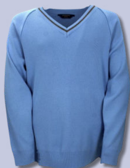
*V neck jumper