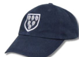
Hat or plain black (no sports logos)