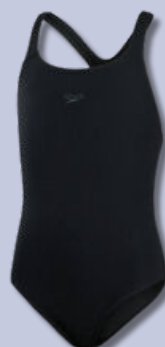
Plain black girls swimming costume or Crosfields branded swim suit