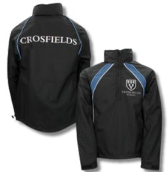
*PE track top