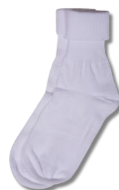
Turn over socks Must be white