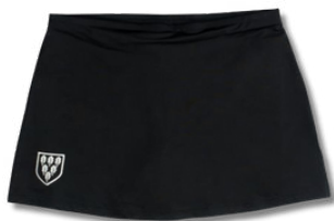
*Games skirt (girls)