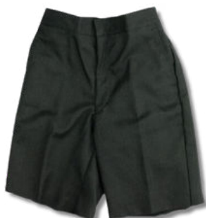
Bermuda charcoal shorts