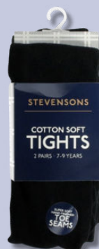
Black knee high socks or plain black tights