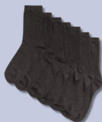
Charcoal ankle socks worn with trousers