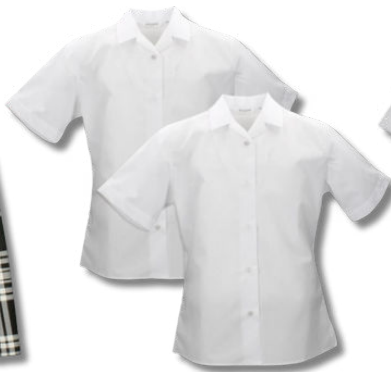
Short sleeved white blouse french collar