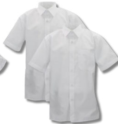
Short sleeved white shirt