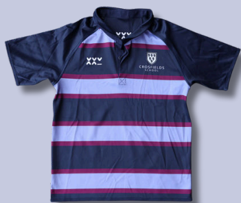
*Slim/standard fit games top