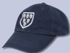
Hat or plain blue (no big logos)