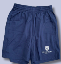
*Slim/standard fit shorts