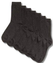
Charcoal ankle socks worn with trousers