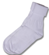
Turn over socks worn with skirts (must be white)