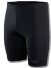
Plain black boys jammers or Crosfields branded jammers