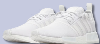
Trainers with non-marking sole