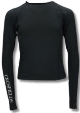
Base layer or plain black