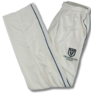
*Cricket trousers (worn in the Summer Term for those choosing Cricket)