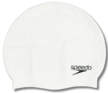
Plain white swim cap (boys and girls)