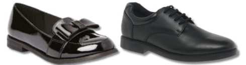
Plain black school shoes, flat, closed toe