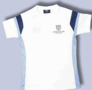
*Slim/standard fit PE top