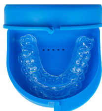
Mouth guards (for the Hockey and Rugby season if pupils choose to play these sports)