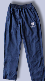
*Tracksuit bottoms standard fit (compulsory)