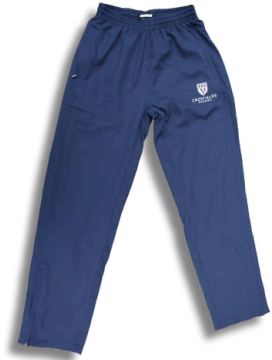
*Tracksuit bottoms slim fit (doubles up as girls Cricket trousers)