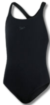
Plain black girls swimming costume or Crosfields branded swim suit