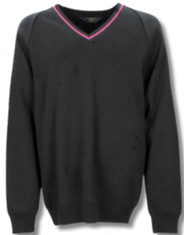
**V neck jumper or slipover