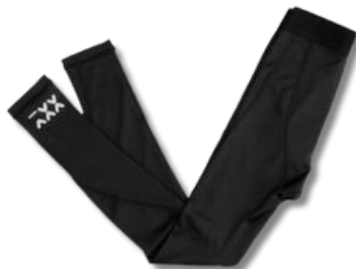
Performance leggings or plain black