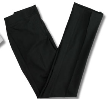
Straight leg black trousers