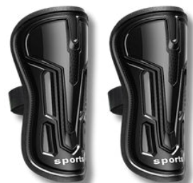
Shin pads (for Football and Hockey season if pupils choose to play these sports)