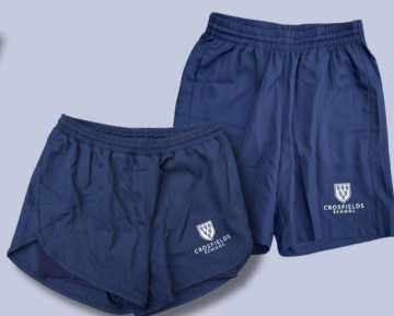
*Slim/standard fit shorts