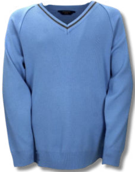
*V neck jumper