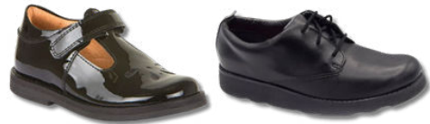
Plain black school shoes, closed toe