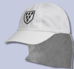
*Legionnaire hat (Nursery and Reception)