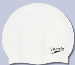
Plain white swimming cap (boys and girls)