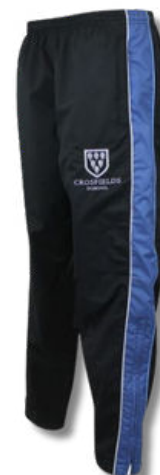
*PE track pants