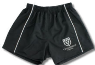
*Games shorts (boys)