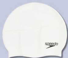
Plain white swim cap (boys and girls)