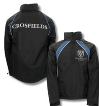
*PE track top