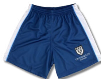
*PE shorts (girls and boys)