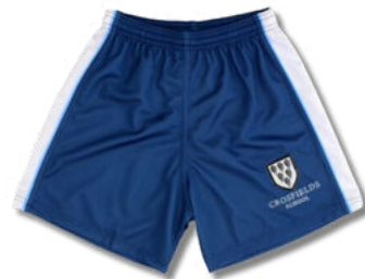
*PE shorts (girls and boys)