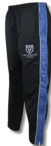
*PE track pants