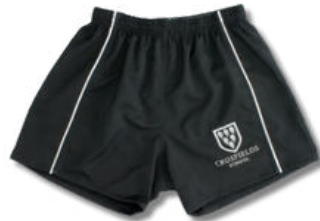
*Games shorts (boys)