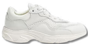
Trainers with non-marking sole