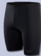
Plain black boys jammers or Crosfields branded jammers