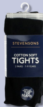
Black knee high socks or plain black tights