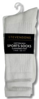
White sport socks