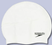
Plain white swim cap (boys and girls)