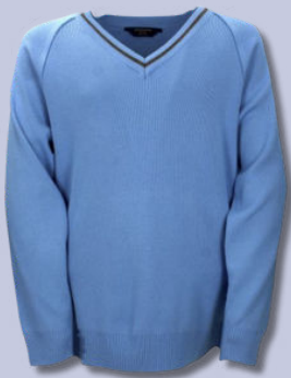
*V neck jumper