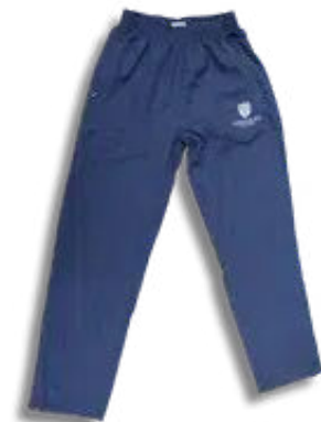
*Tracksuit bottoms slim fit doubles up as girls' cricket trouser