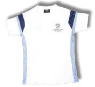
*PE top (boys only)