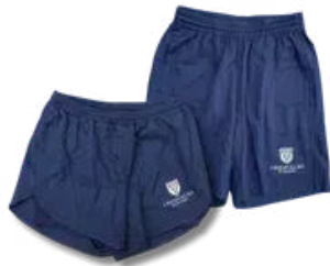
*Slim Standard fit shorts