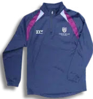
*PE track top