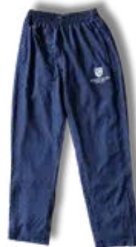
*PE tracksuit bottoms standard fit compulsory