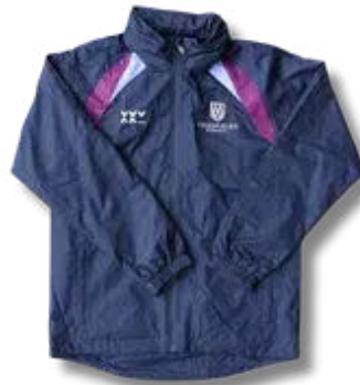
*PE track top