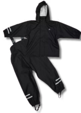
Black, PU Elka rain set, must be purchased from muddyfaces.co.uk