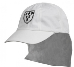
*Legionnaire hat (optional)