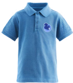
Nursery polo shirt (available from School Shop)

For full uniform information, please contact admissions@crossfields.com