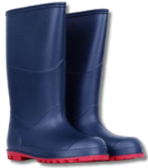
Wellington boots, any colour permitted