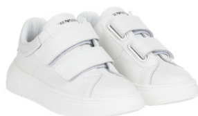
Predominantly white velcro trainers with non-marking sole