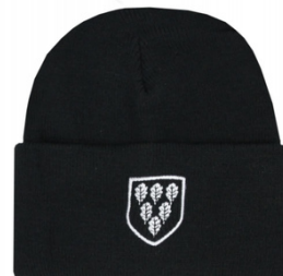
*Knitted hat (optional)