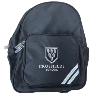
Pre-Prep backpack (optional)