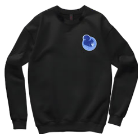
Nursery round neck jumper (available from School Shop)