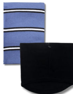
Knitted scarf or plain black snood