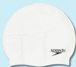
Plain white swimming cap (boys and girls)