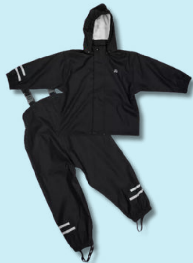
Black, PU Elka rain set, must be purchased from muddyfaces.co.uk