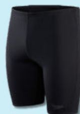
Plain black boys jammers or Crosfields branded jammers