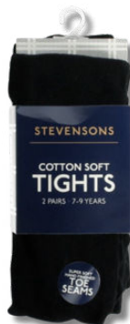
Black knee high socks or plain black tights