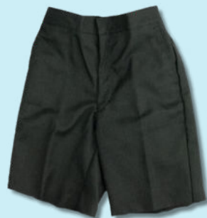
Bermuda charcoal shorts