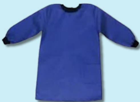
*Blue nylon painting apron