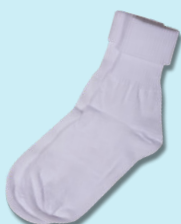
Turn over socks (must be white)