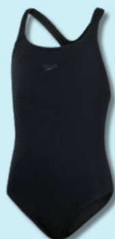
Plain black girls swimming costume or Crosfields branded swimming costume