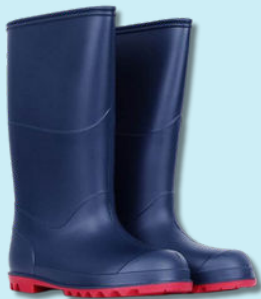
Wellington boots, any colour permitted (Please note these are kept at school during term time)