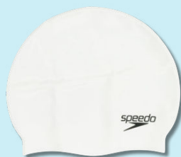
Plain white swimming cap (boys and girls)