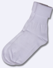
Turn over socks (must be white)