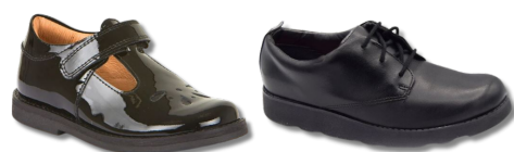
Plain black school shoes, closed toe