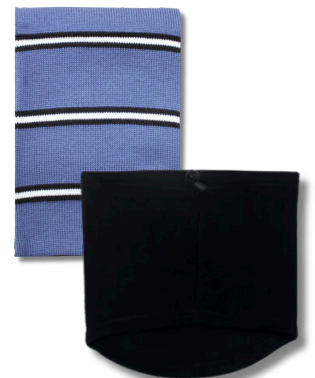
Knitted scarf or plain black snood