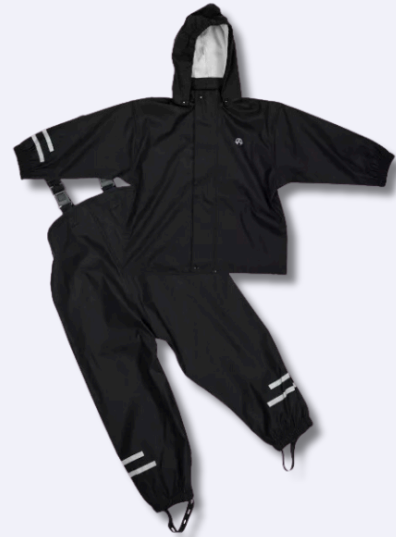
Black, PU Elka rain set, must be purchased from muddyfaces.co.uk