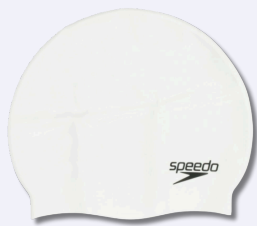
Plain white swimming cap (boys and girls)