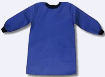
*Blue nylon painting apron