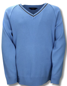
*V neck jumper