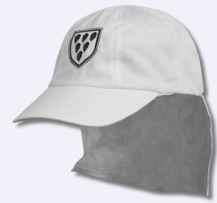
*Legionnaire hat (Nursery and Reception)