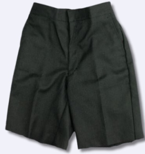
Bermuda charcoal shorts