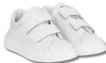
Predominantly white velcro trainers with non-marking sole