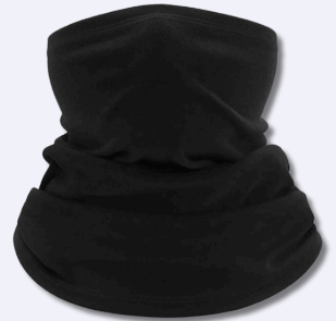
Plain black or navy necker