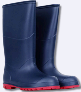
Wellington boots, any colour permitted (Please note these are kept at school during term time)