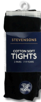
Black knee high socks or plain black tights