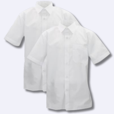
Short sleeved shirt