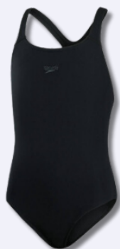
Plain black girls swimming costume or Crosfields branded swimming costume