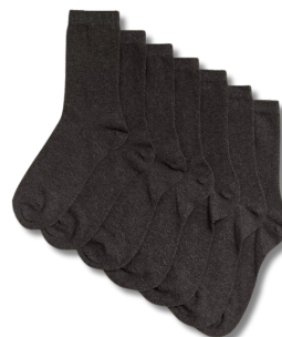
Charcoal ankle socks