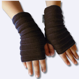
Plain black or navy wristees