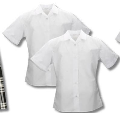
Short sleeved white blouse french collar