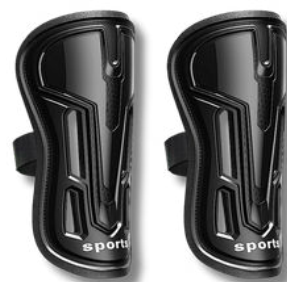
Shin pads (for Football and Hockey season if pupils choose to play these sports)