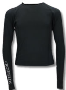
Base layer or plain black