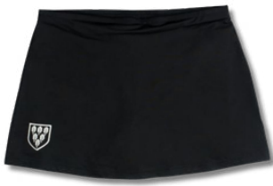
*PE skort or plain black shorts