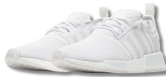
Trainers with non-marking sole