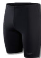
Plain black boys jammers or Crosfields branded jammers