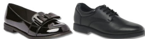
Plain black school shoes, flat, closed toe