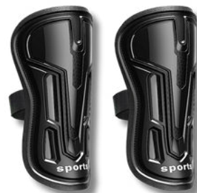
Shin pads (for Football and Hockey season if pupils choose to play these sports)