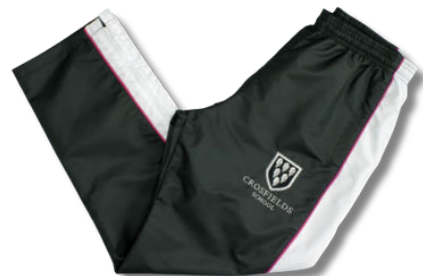
*PE track pants