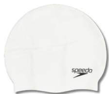
Plain white swim cap (boys and girls)