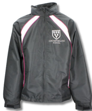
*PE track top