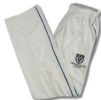
*Cricket trousers (worn in the Summer Term for those choosing Cricket)