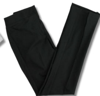
Straight leg black trousers