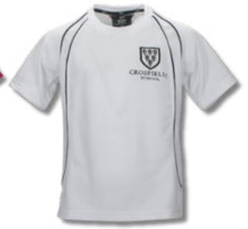
*PE top (boys only)