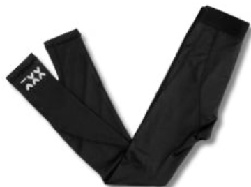
Performance leggings or plain black