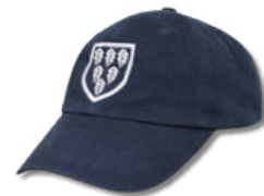
Hat or plain black (no sports logos)